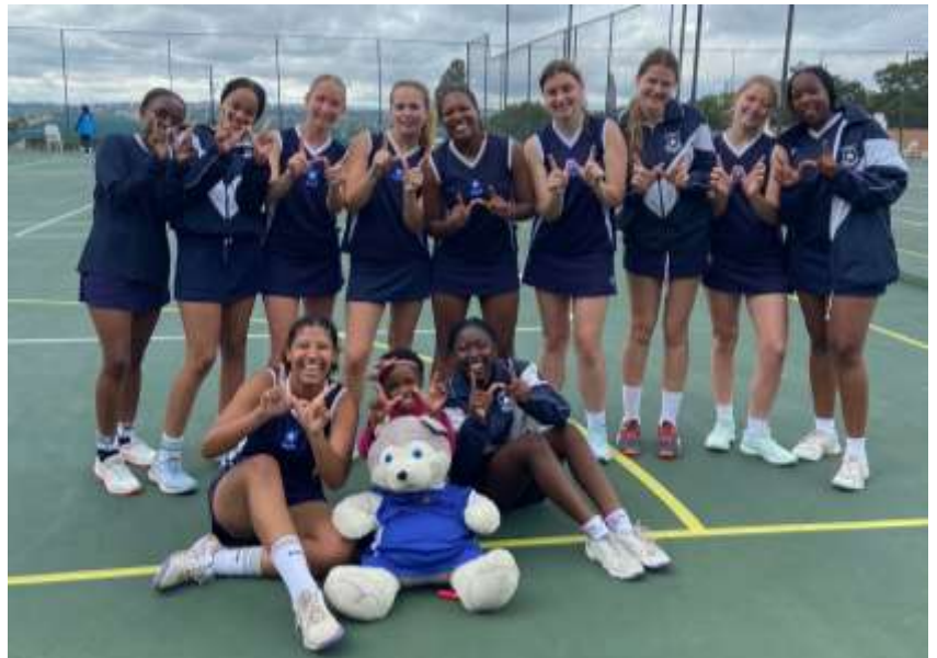
Parktown Netball 1 st Team after their win against Kingsmead College