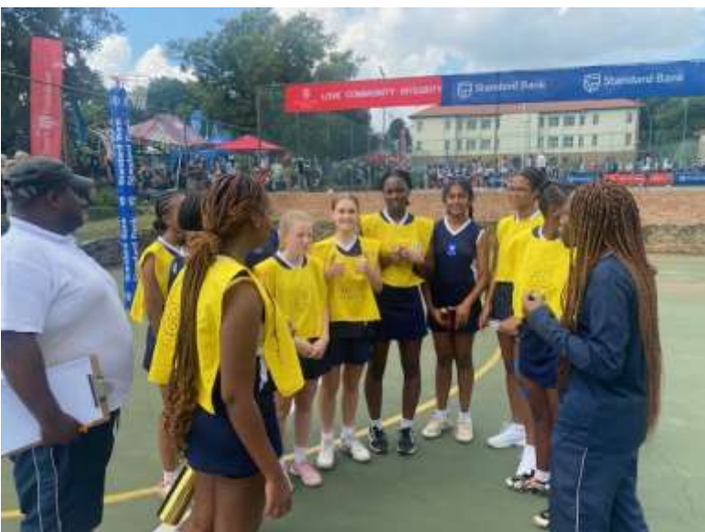
Parktown U15 A Team ready for the match against St Johns