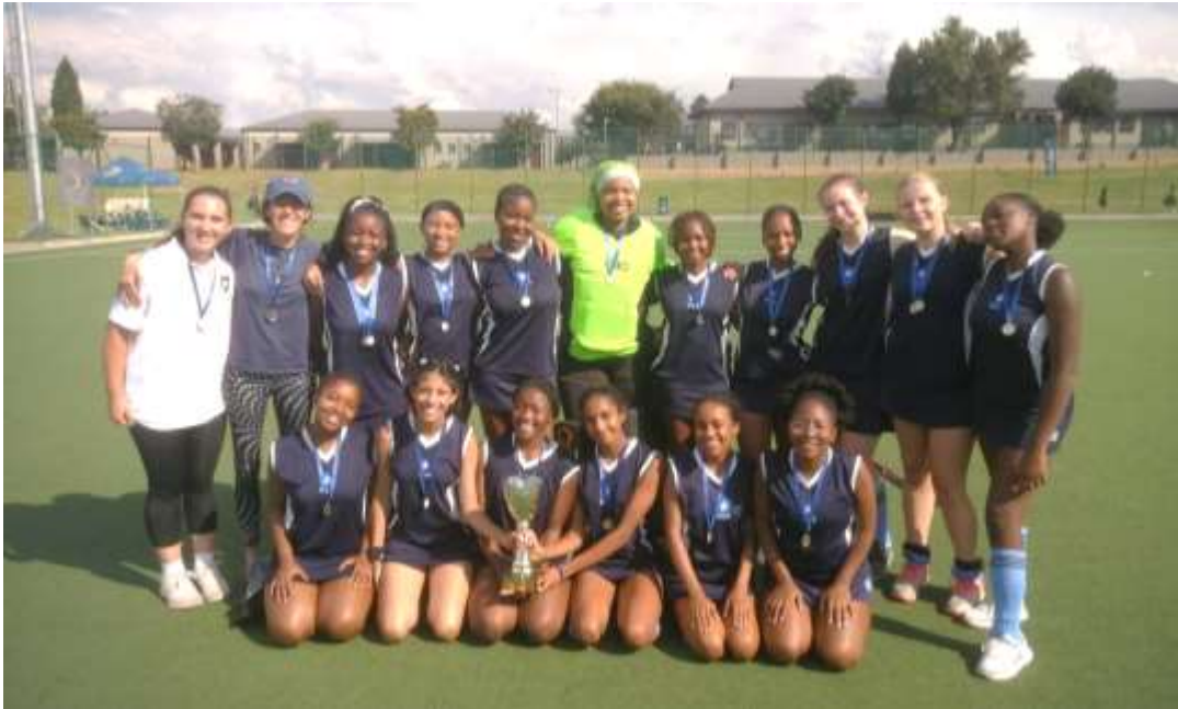
Parktown 2 nd Team with their trophy