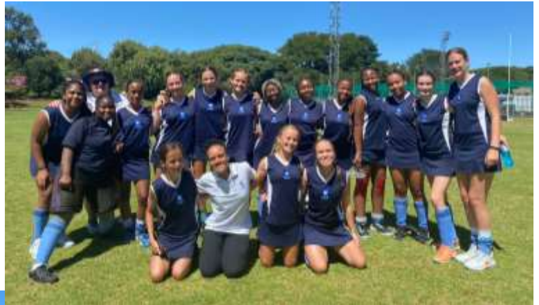
Parktown U16 A Touring Team