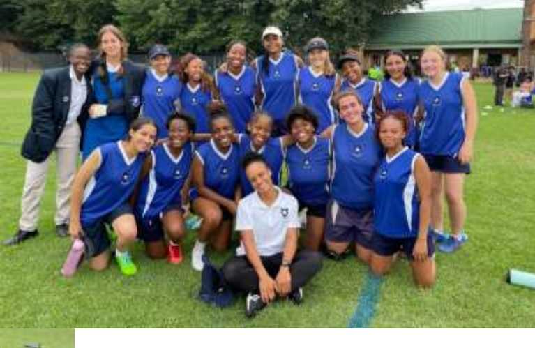
Parktown U14 Touch Rugby Team