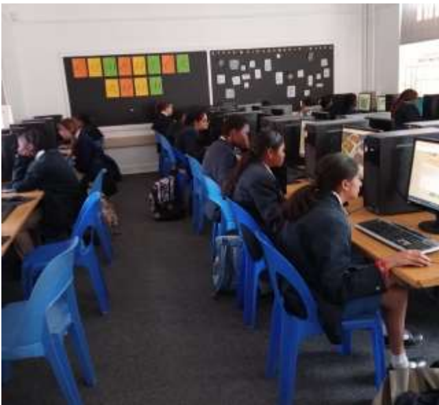
Learners completing the Junior Geography Olympiad in the computer room