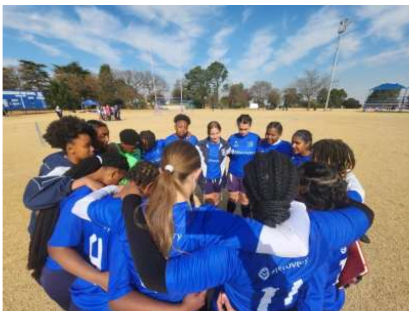
Parktown Soccer First Team at the Best of the West Festival

A reminder for all the supporters, that cannot make the home matches to support our teams in person, that we do have the SuperSport Schools camera livestreaming all the home matches. You can find the livestream via the SuperSport Schools App. Instructions on how to download the app are on the D6 Communicator – Resources – Sport.