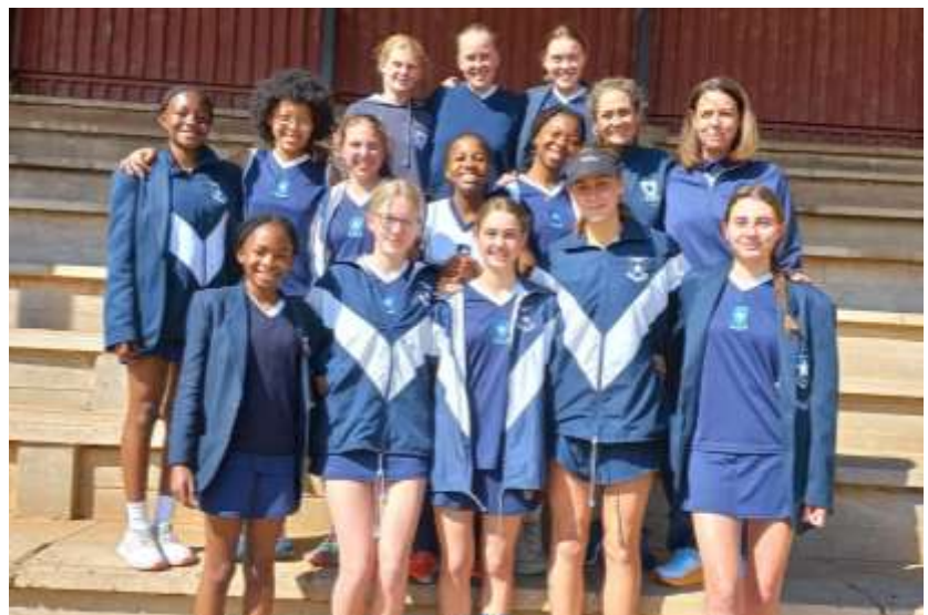
Our Parktown runners at Voorentoe High School